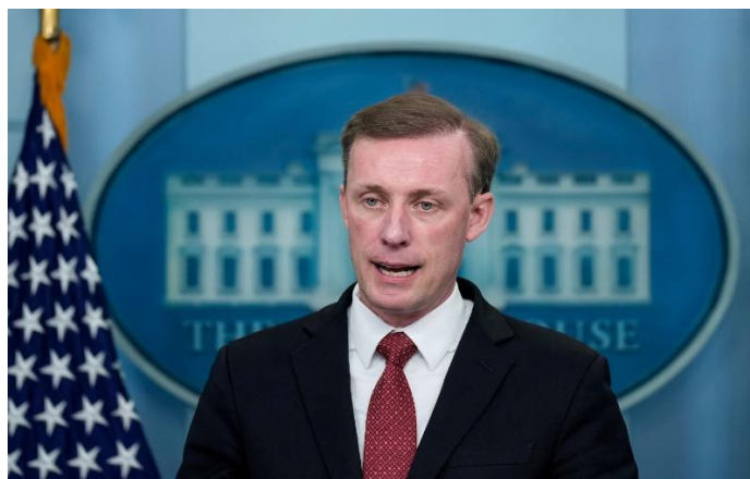
Jake Sullivan, 10 October 2023.

Palestinians in Gaza have said that Israeli bombardment has been heavy and feels like a new "Nakba," the Arabic word for catastrophe that refers to the 1948 war of Israel's creation that led to their mass dispossession. 46