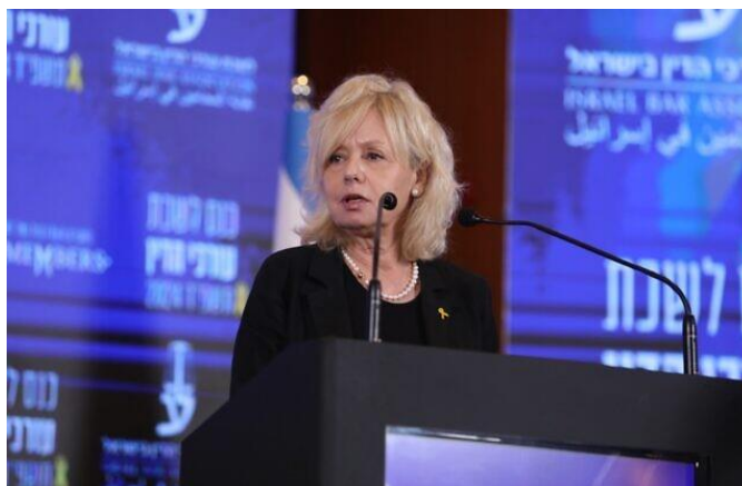
Israeli Attorney General, Ms. Gali Baharav – Miara.

15. Israel's Finance Minister and Member of the Security Cabinet Bezalel Smotrich called for total annihilation of Gaza. 13 Israeli police closed an investigation against a Rabbi head of a Yeshiva who advocated for killing all Palestinians in Gaza. 14 Israeli Attorney General Gali Baharav – Miara neither said nor take any measure regarding Israel's intended international criminality, but she did warn Israeli Ministers to be careful with their words as they might be used against them in a court of law and thus provide “ammunition for Israel's enemies.” 15 As emphasized in our letter of 22 June 2024, given Ms. Baharav – Miara role and function in the Israeli governmental structure, her actions and inactions generate international individual criminal responsibility also against her. Baharav – Miara's understanding of international law is limited and traditional in Israeli terms aimed at establishing domestic inquiry the purpose of which is to fend proceedings before international tribunals. There is no intention to uphold the rule of law, seek accountability, and counter impunity. 16