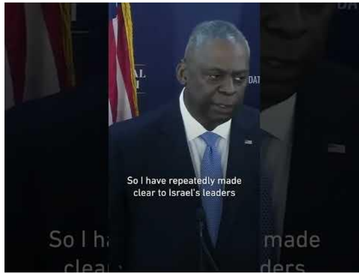
U.S. Secretary of Defense Lloyd Austin about Israel’s conduct “the center of gravity is the civilian population”, 2 December 2023 (video).

of a fight the center of gravity is the civilian population”, 57 Biden administration nevertheless continued its unwavering fevered military and diplomatic backing of Israel. A glaring example of that is Biden’s statements during the Hanukkah reception at the White House on 9 December 2023. 58 Biden disregarded Austin. The Secretary of Defense focused on his future.