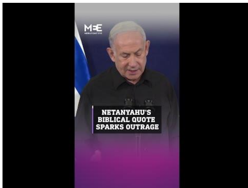
Netanyahu utilizing biblical terminology of Amalek demonstrating an intent to commit genocide, 28 October 2023 (video).