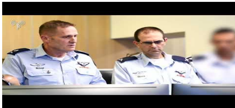
Commander of IDF's Air Force Tomer Bar: “We are already in the 6 th day of the war, after thousands of bombs, more than 6,000 bombs dropped on Gaza” (video).

10. IDF's senior command proclaimed similar statements and intent. On 12 October 2023 IDF's Chief of Staff Herzi Halevi said “the fighting spirit of the IDF is pounding Gaza with all its force and we will not stop here...Gaza shall not look the same.” 8 Commander of IDF's Air Force Tomer Bar said early in the war “it's a long war. We are already in the sixth day. We are after thousands of bombs, 6000 bombs dropped on Gaza...you know the Air Force, you know the IDF, no one limits us. I instructed to continue the attacks forcefully.” 9 On 16 November 2023 he (Tomer Bar) said “we are operating with intensity and forcefully. Gaza's face has changed.” 10