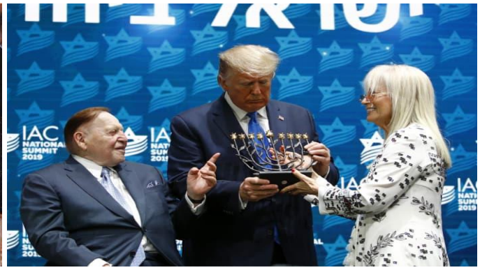
Sheldon Adelson on the Left

63. We have illustrated above Biden’s exceptional ideological admiration of Israel. He has frequently boasted about his enduring metaphysical cherishing and commitment to that country. Biden is also the top Senator recipient of pro – Israel funding between 1990 – 2024. His pool of money from that source totals $4,223,393 according to Open Secrets website. 94 Biden’s ideology has been compounded by a steady stream of finance from one of America’s most powerful lobbies. It would be naïve and unintelligible to presume that Biden’s lifelong pro-Israel funding did not affect his and the U.S. administration’s decision-making during Israel’s horrendous violations of international law in Gaza reaching at least the level of aiding and abetting genocide, crimes against humanity, and war crimes.