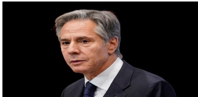
U.S. Secretary of State Anthony Blinken. Image from Jerusalem Post, September 2023, who placed him third on the list of most influential Jews in the world, after Netanyahu and Sam Altman.

53. Biden administration’s indefensible total support of Israel’s illegal war and clear complicity in its crimes in Gaza is manifested by its obstinate diplomatic cover at the U.N. Security Council vetoing attempts to realize humanitarian pause or ceasefire. Given the perpetual flow of arms to Israel, the administration’s combative rhetoric at home and abroad, and its willful disregard of Palestinians’ rights since before the war, 73 Biden administration’s malicious diplomacy is conceptually the highest level of aiding and abetting verging on co-perpetration.