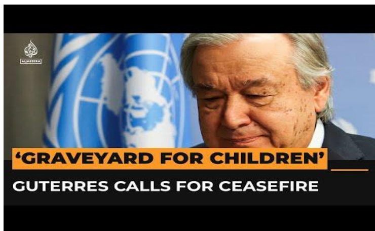
U.N. Secretary General Antonio Guterres, "Gaza is becoming a graveyard for children", 6 November 2023 (video).

Gaza is becoming a graveyard for children. Hundreds of girls and boys are reportedly being killed or injured every day. More journalists have reportedly been killed over a four-week period than in any conflict, in at least three decades. More United Nations aid workers have been killed than in any comparable period in the history of our organizations. We must act now to find a way out of this brutal, awful, agonizing death and destruction.