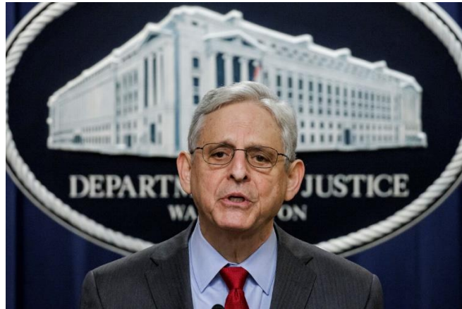
U.S. Attorney General Merrick Garland

60. U.S foreign policy protected Israel from accountability and furnished it with complete impunity. This flagrant scheme received unstated backing by U.S. Attorney General Merrick Garland’s silence regarding Israel’s voluminous atrocities in Gaza reported and aired internationally and in the United States. Garland was vocal regarding Russia’s violations of international law, 89 but remained unmoved by Israel’s deliberate brutality in Gaza despite disproportionately outweighing Russia’s illegality. 90