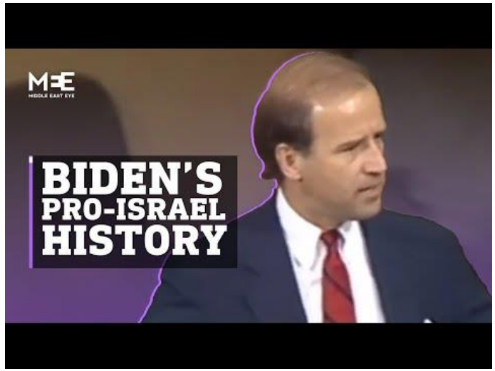
Biden before Jewish Federations of North America, 2016 (video). Biden’s total support for Israel throughout his career (video).

38. Biden’s exceptional ideological commitment towards Israel led him to metaphysically denote grave support to a country who is both an illegal occupying power 43 and an apartheid 44 state faced with armed resistance. He called the Palestinian side ‘pure, unadulterated evil’ and pledged ‘swift, decisive, and overwhelming’ support for Israel’s war on Gaza. 45 Biden also repeatedly reverberated Israel’s lies about what took place on 7 October 2023, including Palestinians burning babies and raping of women.