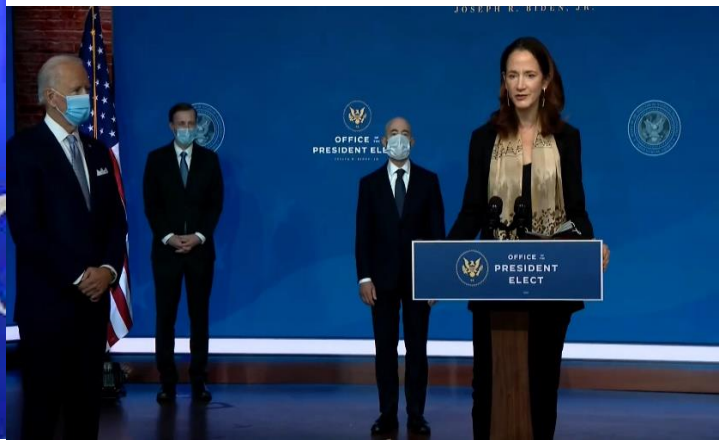
Avril Haines, Director of National Intelligence