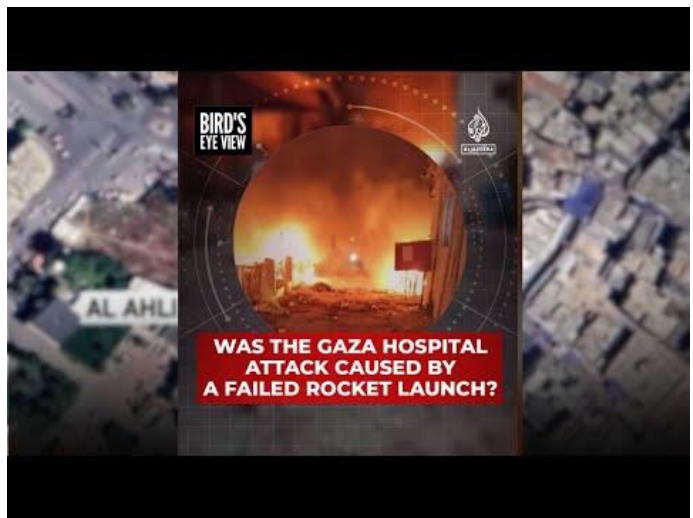
Al-Jazeera English investigation, 19 October 2023 (video).