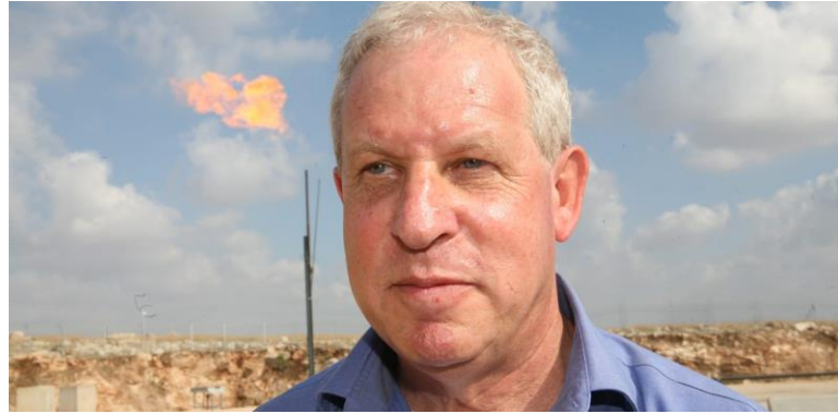
Giora Eiland, captured by Globes newspaper, 8 October 2023.

way is to create a severe humanitarian crisis in Gaza. When international institutions shout about a humanitarian crisis in Gaza and bodies are piling up in the hospital and they cannot treat them, we will reply, 'We have no problem solving the real problems of Gaza, but give us back our prisoners first.' 11