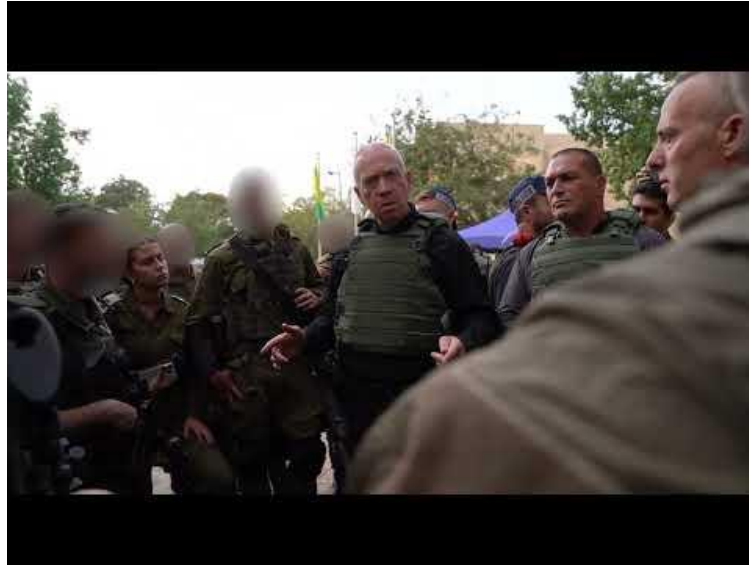
“Gloves are off”. Gallant at IDF's Gaza Division, 10 October 2023 (video). 7

I released all restraints. Attacking everything. Gloves are off...from air, land, with tanks, and bulldozers. All measures. No compromises. Gaza will not return to what it was...we will eliminate everything...we can't end this matter just like that because we will not exist in the Middle East. Without deterrence there is no existence in the Middle East.