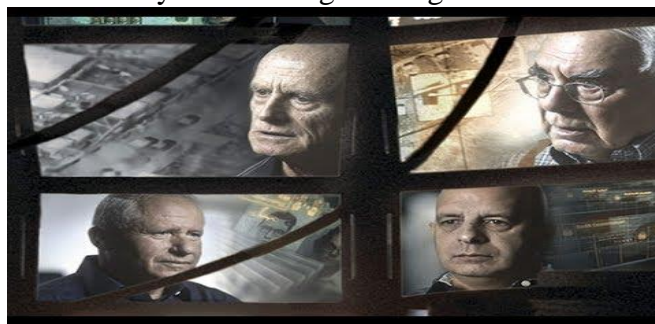
The Gatekeepers, 2012, First Episode (video).

24. Israel engaged in illegal and degrading mass arrests and torturing detainees as part of its systematic effort to target civilians accomplishing additional crimes against humanity. Israel's policy received international attention and condemnation. 33 Torture has characterized the work of the Israel Security Agency for decades. In the first episode of five of a special 2012 documentary featuring several heads of this organization titled The Gatekeepers , the lasting deplorable practice of torture is sarcastically acknowledged and gloated.