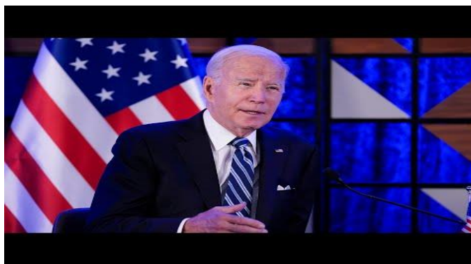
Biden blames 'other team' for hospital blast at Gaza City hospital, Associated Press, 18 October 2023 (video).