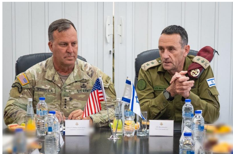
Kurilla with IDF’s Chief of General Staff Halevi, June 2024

47. Biden administration’s purported public disagreements with Israel did not affect the devastating constant American military support. 59 On the contrary, the U.S. military strategic assistance to Israel continued unabated notwithstanding its gravest of crimes. Commander of U.S. Central Command of the U.S. military Gen. Michael Kurilla exercised close operational cooperation with Israel’s military. 60