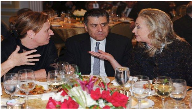
Haim Saban at the Center