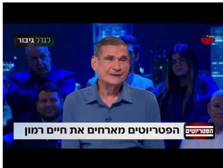
Haim Ramon, "we are not cruel enough", Israeli Channel 14, 10 December 2024 (video).